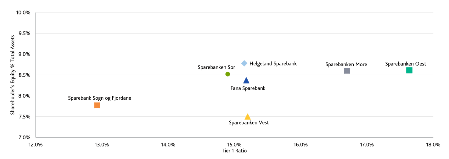
Exhibit 3 Sizeable capital buffers offering protection against unforeseen losses compare well with peers

Data as of September 2016