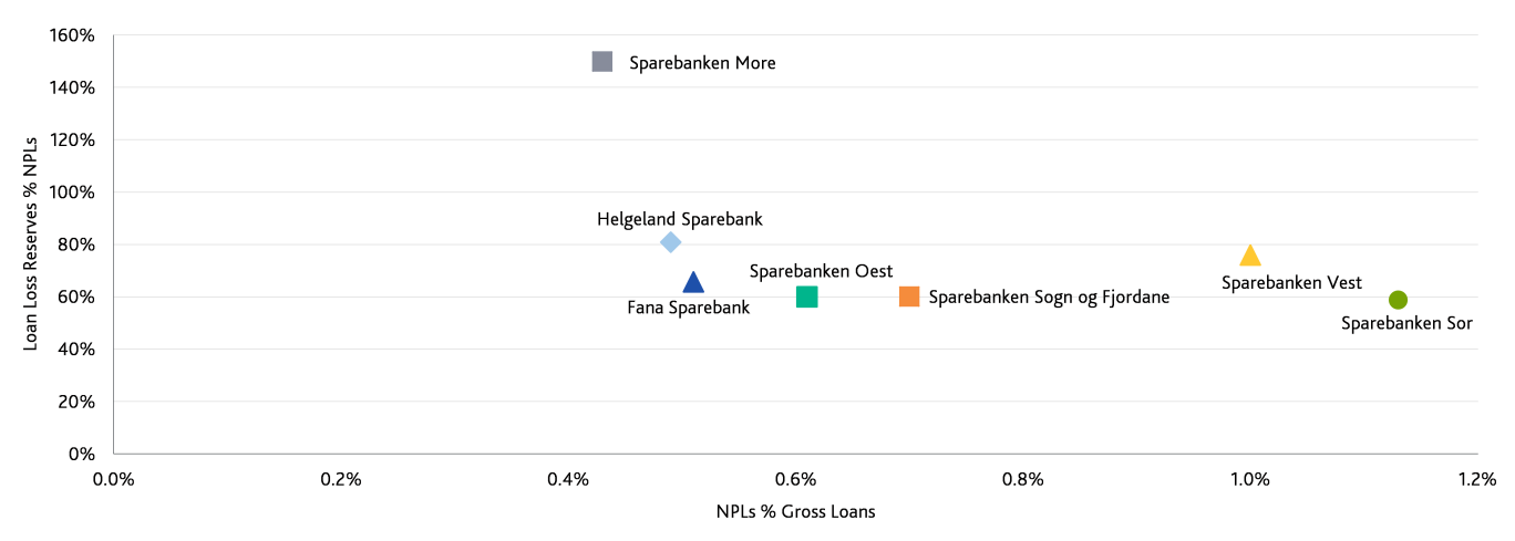
Exhibit 4 Low level of problem loans and high balance sheet reserves coverage compared with peers

Data as of September 2016