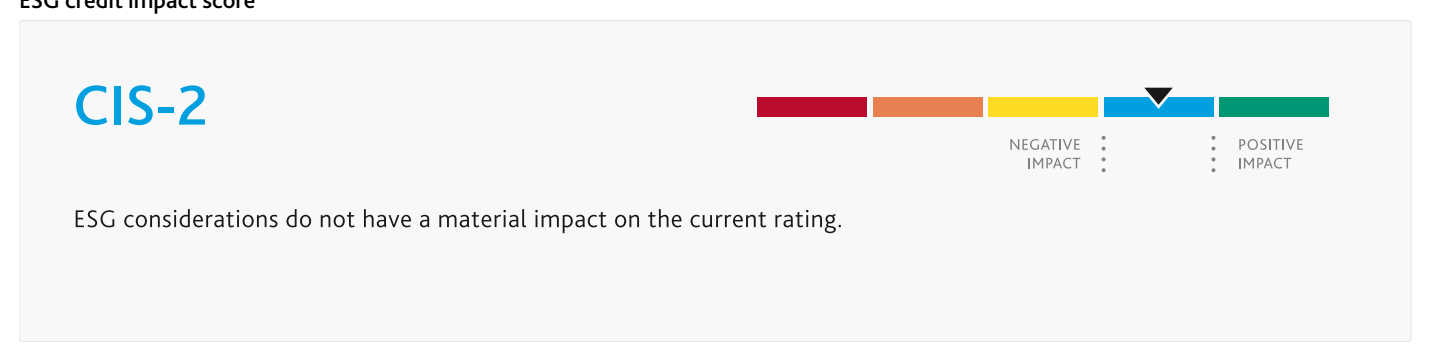
ESG credit impact score

Sparebanken More's ESG credit impact score is CIS-2